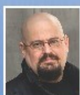
Charles Stross Special Guest