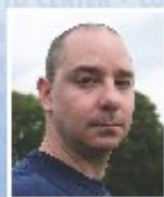
John Scalzi Writer Guest of Honor

July 1-4, 2016 • DoubleTree by Hilton Portland