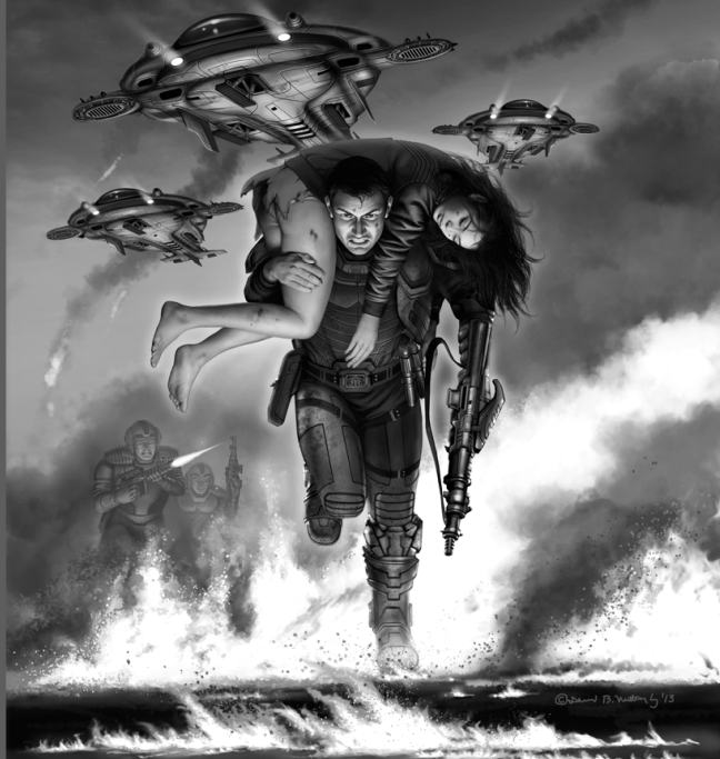
Cover art for "Beginnings: Worlds of Honor 6", Ed. David Weber

FROM SWORDS & SORCERY TO PHASERS & GRASERS